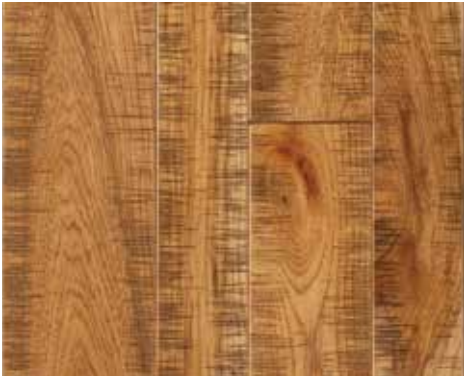
Species: HICKORY Grade: CHARACTER Width: 3", 4", 5" Edge: 1/16" MICROBEVEL Face: CROSS SAWN Color: 112 PROVINCIAL Sheen: MATTE