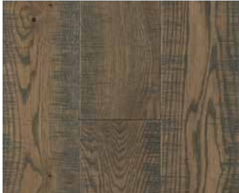
Species: WHITE OAK Grade: CHARACTER Width: 5" Edge: 1/16" MICROBEVEL Face: CROSS SAWN Color: 118 ANTIQUE SLATE Sheen: MATTE