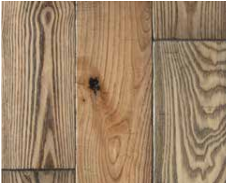
Species: ASH Grade: CHARACTER Width: 5" Edge: HANDSCRAPED Face: SEASONED & WEATHER BRUSHED Color: BLACK GLAZE Sheen: MATTE