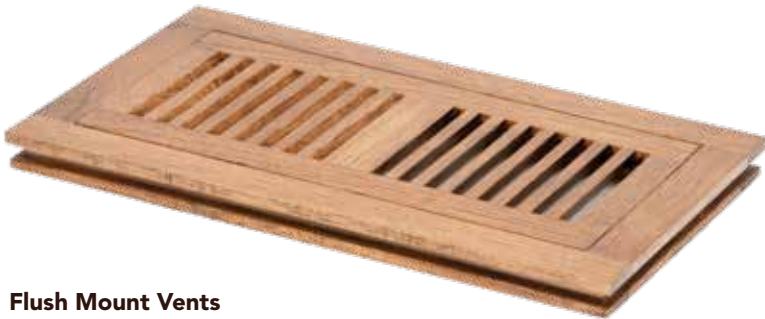
Flush Mount Vents 3/4" solid wood

Enhance the look of your IBEX™ floor with matching hardwood vents.