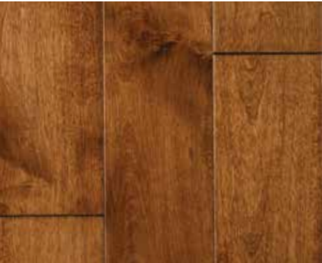
Species: BIRCH Grade: CHARACTER Width: 5" Edge: 1/16" MICROBEVEL Face: LIGHT HANDSCRAPED Color: 117 ASBURY Sheen: MATTE