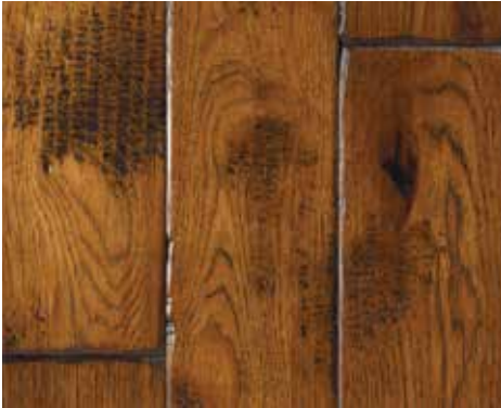
Species: HICKORY Grade: CHARACTER Width: 5" Edge: HANDSCRAPED Face: MILL Color: 228 RICH TOBACCO Sheen: MATTE