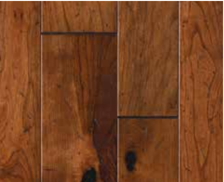
Species: CHERRY Grade: CHARACTER Width: 3", 4", 5" Edge: 1/8" BEVEL Face: WORMY Color: 107 WASHINGTON & BLACK GLAZE Sheen: MATTE