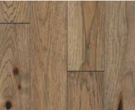
Species: HICKORY Grade: CHARACTER Width: 4" Edge: 1/16" MICROBEVEL Face: SMOOTH Color: 118 ANTIQUE SLATE Sheen: SATIN