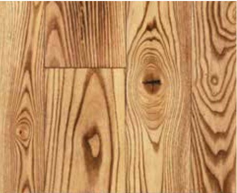
Species: ASH Grade: CHARACTER Width: 3", 4", 5" Edge: 1/16" MICROBEVEL Face: LIGHT HANDSCRAPED & SMOKED Color: 102 FRUITWOOD Sheen: MATTE