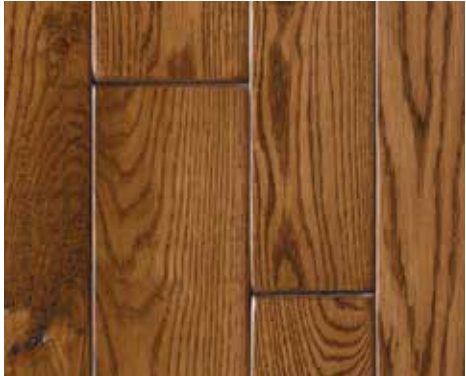
Species: WHITE OAK Grade: CHARACTER Width: 3", 4", 5" Edge: WORN Face: MILL Color: 111 BOSTON Sheen: MATTE