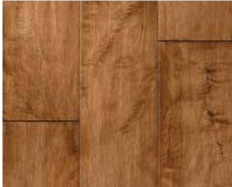
Species: MAPLE Grade: CHARACTER Width: 5" Edge: 1/16" MICROBEVEL Face: LIGHT HANDSCRAPED Color: 111 BOSTON Sheen: MATTE