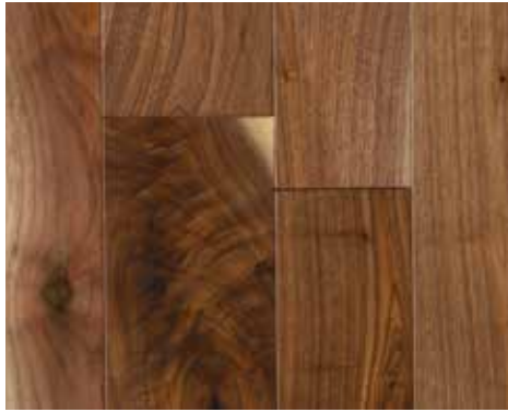
Species: WALNUT Grade: CHARACTER Width: 3", 4", 5" Edge: 1/16" MICROBEVEL Face: SMOOTH Color: CLEAR Sheen: SATIN