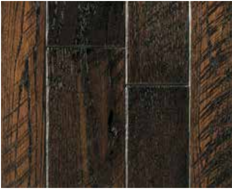
Species: RED OAK Grade: CHARACTER Width: 3", 4", 5" Edge: HANDSCRAPED Face: RADIAL SAWN Color: 230 ONYX Sheen: MATTE