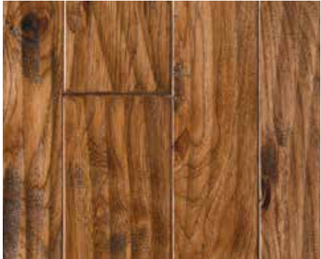
Species: HICKORY Grade: CHARACTER Width: 3", 4", 5" Edge: WORN Face: HEAVY HANDSCRAPED Color: 226 COFFEE Sheen: MATTE

NOTE: Samples shown are for representational purposes only. For precise colors and details, see the IBEX™ display at your local retailer.