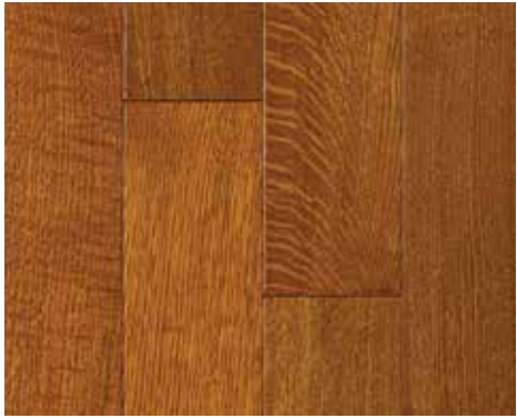
Species: QTR/RIFT W. OAK Grade: SELECT Width: 4" Edge: 1/16" MICROBEVEL Face: SMOOTH Color: 113 MICHAEL'S CHERRY Sheen: SEMI-GLOSS