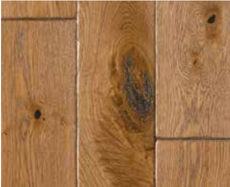
Species: WHITE OAK Grade: CHARACTER Width: 5" Edge: HANDSCRAPED Face: WEATHER BRUSHED & SEASONED Color: 112 PROVINCIAL Sheen: MATTE